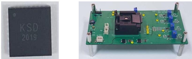
Figure 2. 2 nd generation PCIC (QFN – 32 pins 5mm x 5mm) and its test board

Our state-of-the-art ASIC is capable of sampling and processing a much smaller signal from the photodiode at least 1,000 times faster (in a given time frame) than the existing